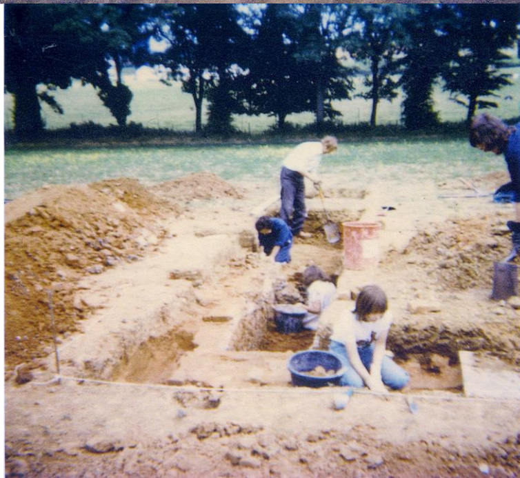
(1) The brick kilns unearthed after excavation (2) A local archaeological group excavated of the brick kilns in Pratts Bottom