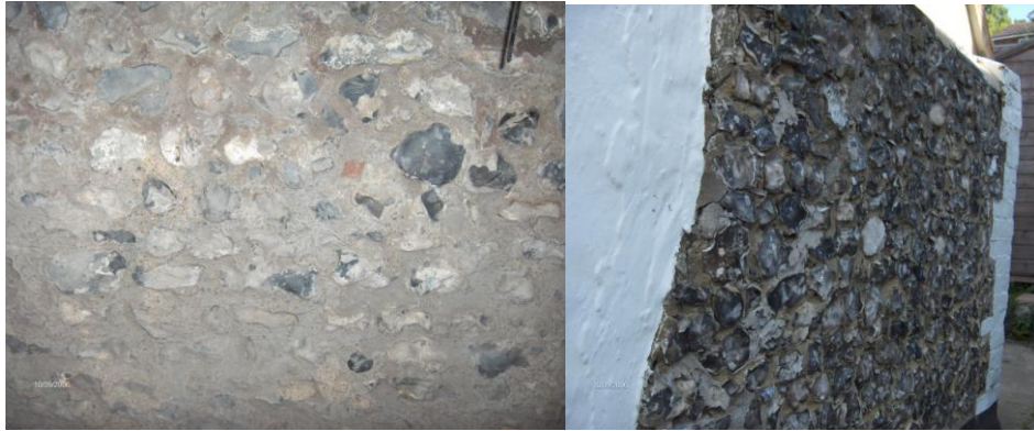
(1) A section of the flint wall in the cellar of Pear Tree Cottage (2) A section of the external flint walls of Pear Tree Cottage.