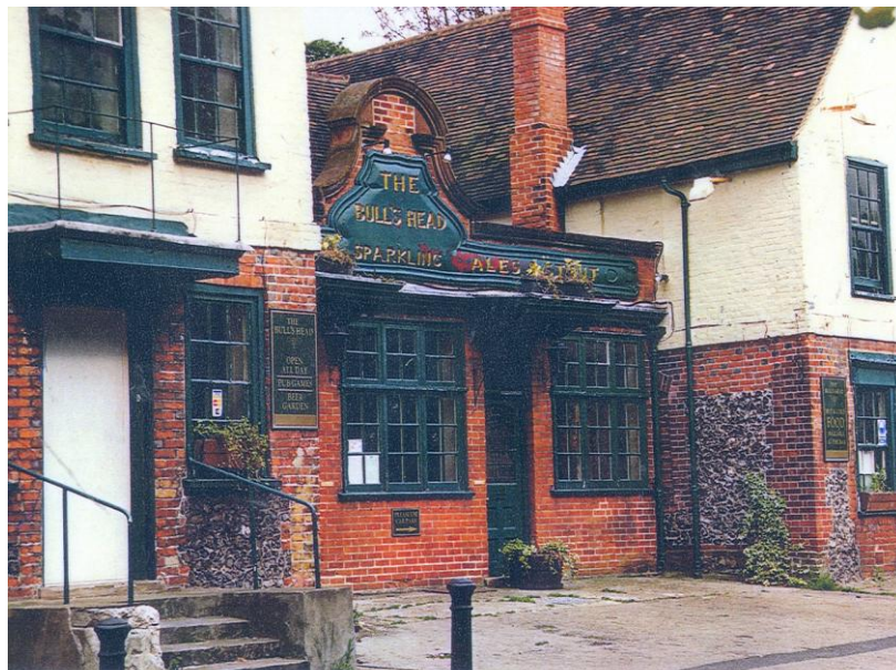
The Bull's Head