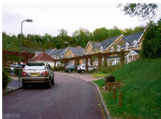
FOXWOOD GROVE, PRATTS BOTTOM