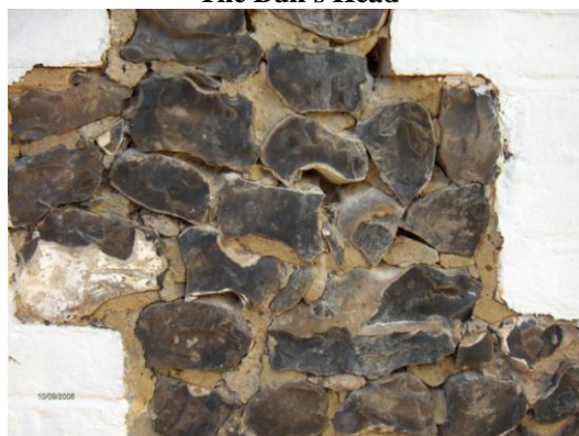
The knapped flint walls of the Bull's Head