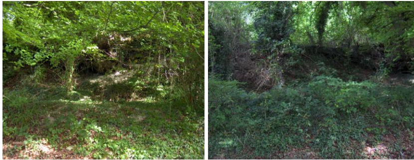
The flint quarry in Hookwood Road