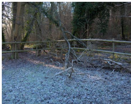
The field where the mammoth tooth was found

For a more detailed description of the geological record of Pratts Bottom please refer to the chapter in