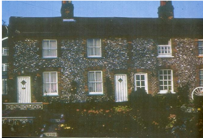
The flint walls of Mount Pleasant Cottages, Rushmore Hill